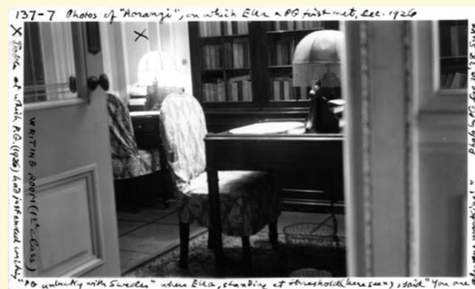
Hand-coloured photograph of the S.S. Aorangi in Auckland, New Zealand.

It is a burning need with me to try to show you how warm is my fondness & admiration for you, how deep my thankfulness to you for the breath of emotional life that was rekindled in me thru seeing you & talking to you during those blessed days of travel on boat & train. You have proved to me that life can still be terrifyingly tempting, torturing, moving even to such a broken, hopeless, weary, sinful failure as I. I may be killed in a railway accident before I see you again. Can you not