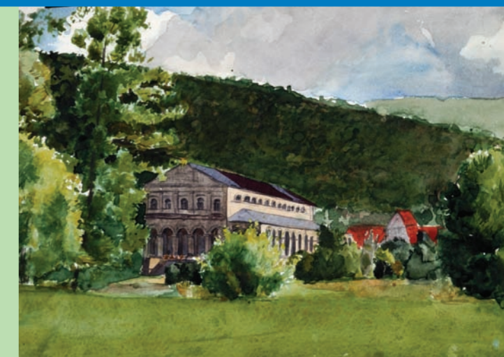
Percy Grainger, Kurhaus At Bad Bruckenau, Oberfranken, watercolour on paper, c.1898. Grainger Collection