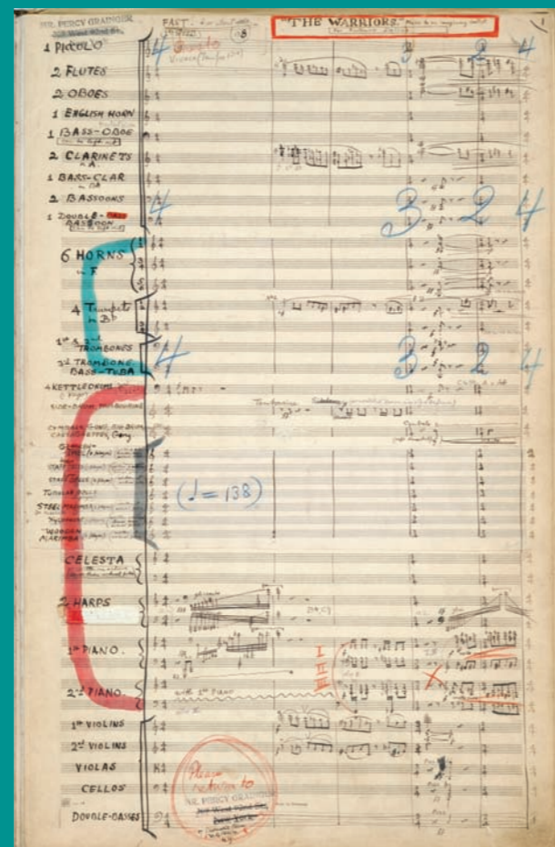
Top: Unknown photographer, Percy Grainger 'In the Round', silver gelatin print, 1933. Grainger Collection Bottom: A page from Percy Grainger's manuscript score The Warriors , performed at the opening ceremony of the Sydney Olympics in 2000. Grainger Collection

Adapted from the Vice-Chancellor's foreword to the Facing Percy Grainger exhibition catalogue.