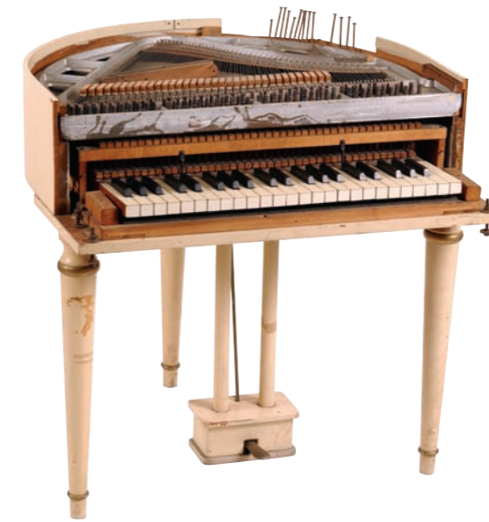
Wurlitzer, Knoxville (USA), Butterfly Piano, 1940s. Small semi-circular piano adjusted by Grainger and tuned to sixth tones for use in his Free Music experiments. Grainger Collection

Except for sporadic small-scale exhibitions, Grainger's contribution to the arts in Australia, England and the US has never fully been acknowledged with an exposition at a major cultural venue. Grainger's reputation in Australia has battled with a combination of this country's discomfort with tall poppies (particularly self-proclaimed blooming luminaries) as well as a fundamental misunderstanding (due largely to ignorance or a lack of available information) of the complex mesh of contradictions that was Grainger's life. In Australia he is often popularly depicted as a whip-wielding mummy's boy, who composed Country Gardens . This exhibition is an enormous opportunity to present Grainger's story, with relevant warts, but in a balanced way. It will describe his involvement with the cultural