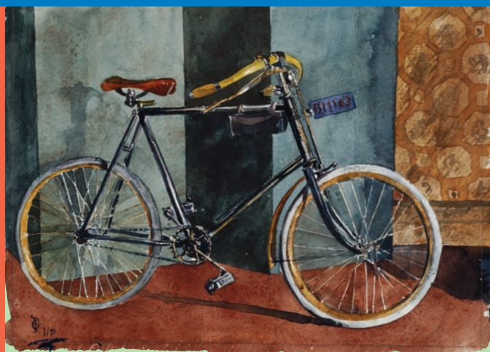
Percy Grainger, Bicycle Belonging to Artist, watercolour on paper, July 1897. Grainger Collection