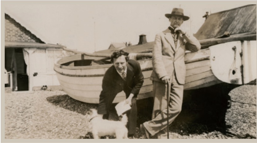
Percy Grainger with dog, and Cyril Scott at Pevensy Bay, Sussex, 1940s.