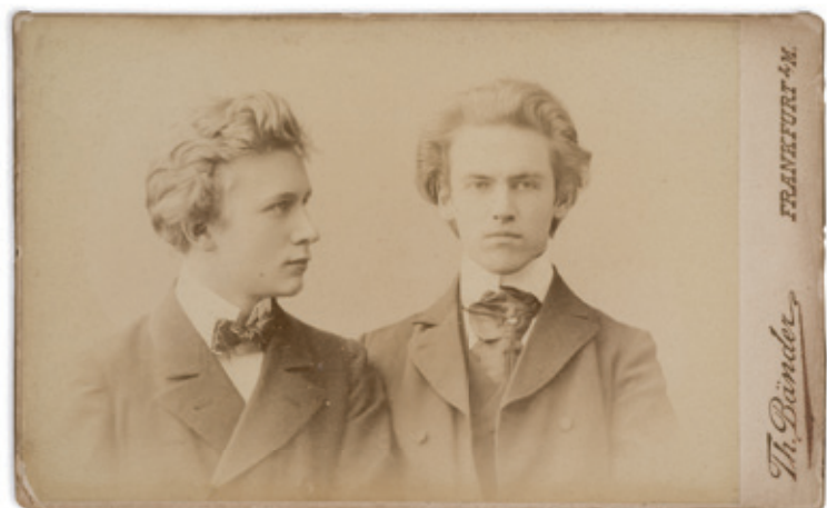
Percy Grainger and Cyril Scott, 1899. Grainger Museum collection.